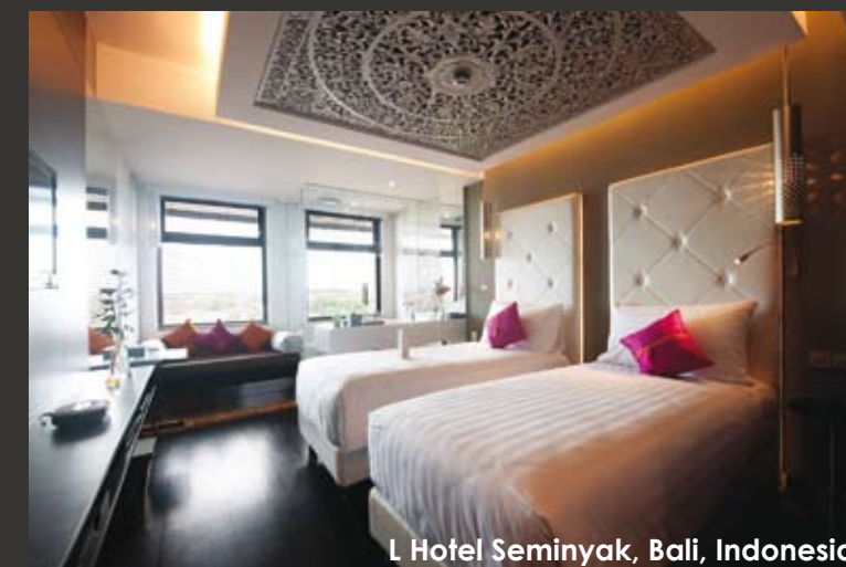
L Hotel Seminyak, Bali, Indonesia