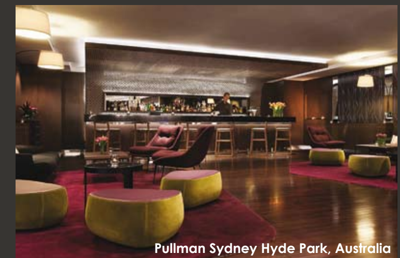
Pullman Sydney Hyde Park, Australia

“My design approach is that of communication through space”