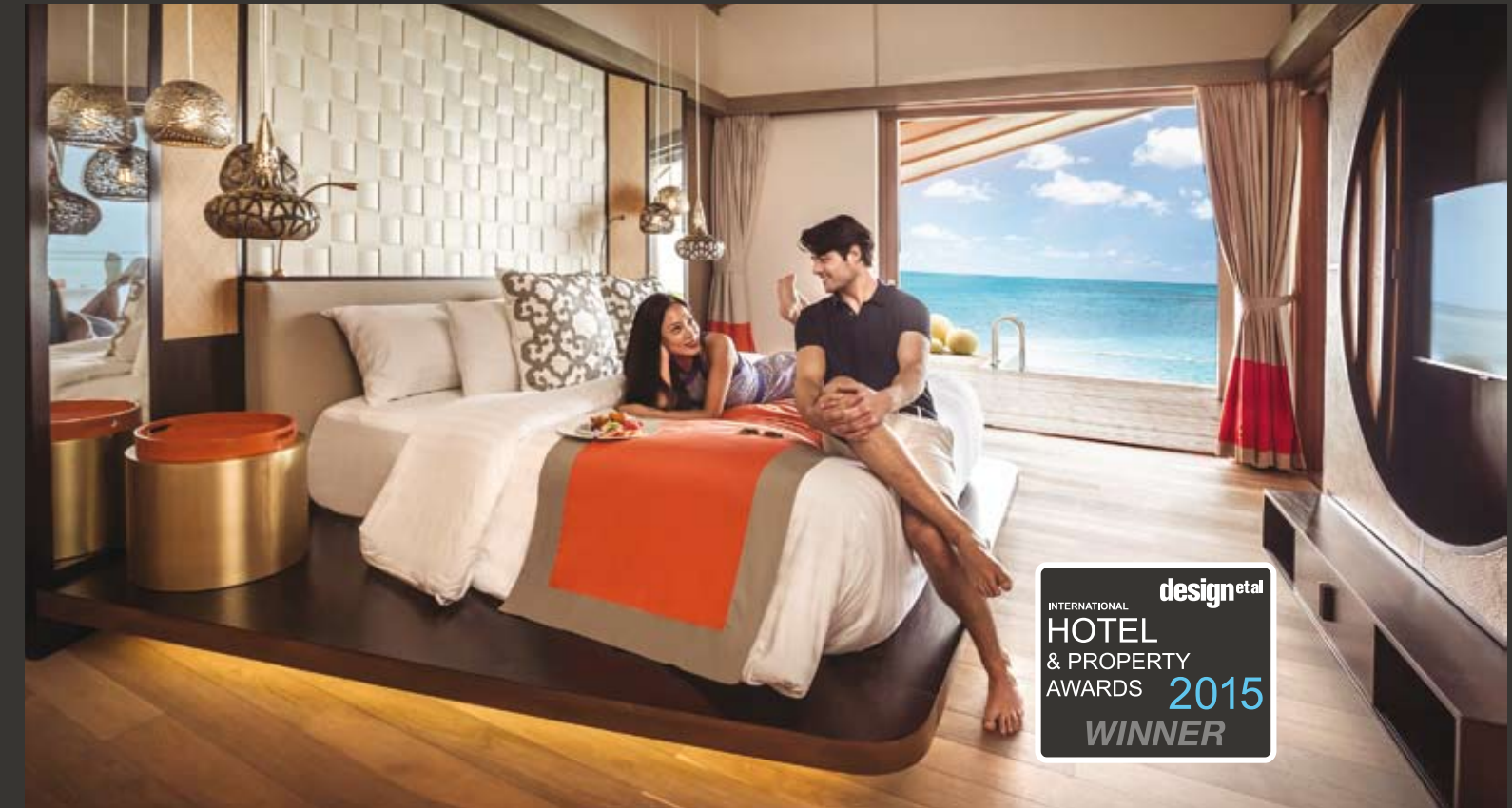
ABOVE: Club Med Finolhu Villas, Maldives Winner of the Global Beach Hotel Category, The International Hotel & Property Awards 2015

“ Each villa is gifted with its own distinct character but the general design of the resort itself is a refined reflection of various cultures to present a worldwide appeal. ”